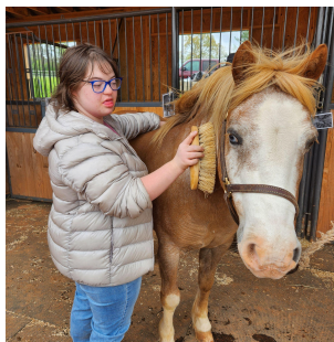
(Olivia & Winston creating connection through grooming)